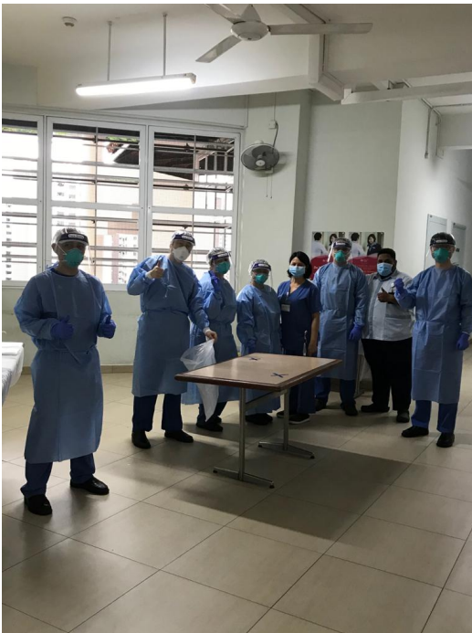
Dressed in full PPE and about to take nasal swabs for the coronavirus.

As the COVID-19 pandemic has been attacking the whole world, this year is indeed a tough one for everyone. In Singapore, the doctors and nurses, including myself, have been fighting hard to save lives. As I work at the Institute of Mental Health --- a psychiatric hospital, many may think that we are not the frontliners, but this is not true --- our patients are from the community and they too have a risk of getting the virus. In fact, it is even more challenging to take care of COVID positive patients with mental illnesses. Our hospital has done a mass swab screening for all the patients to ensure they are not infected by the virus, and that we could immediately quarantine them if tested positive.